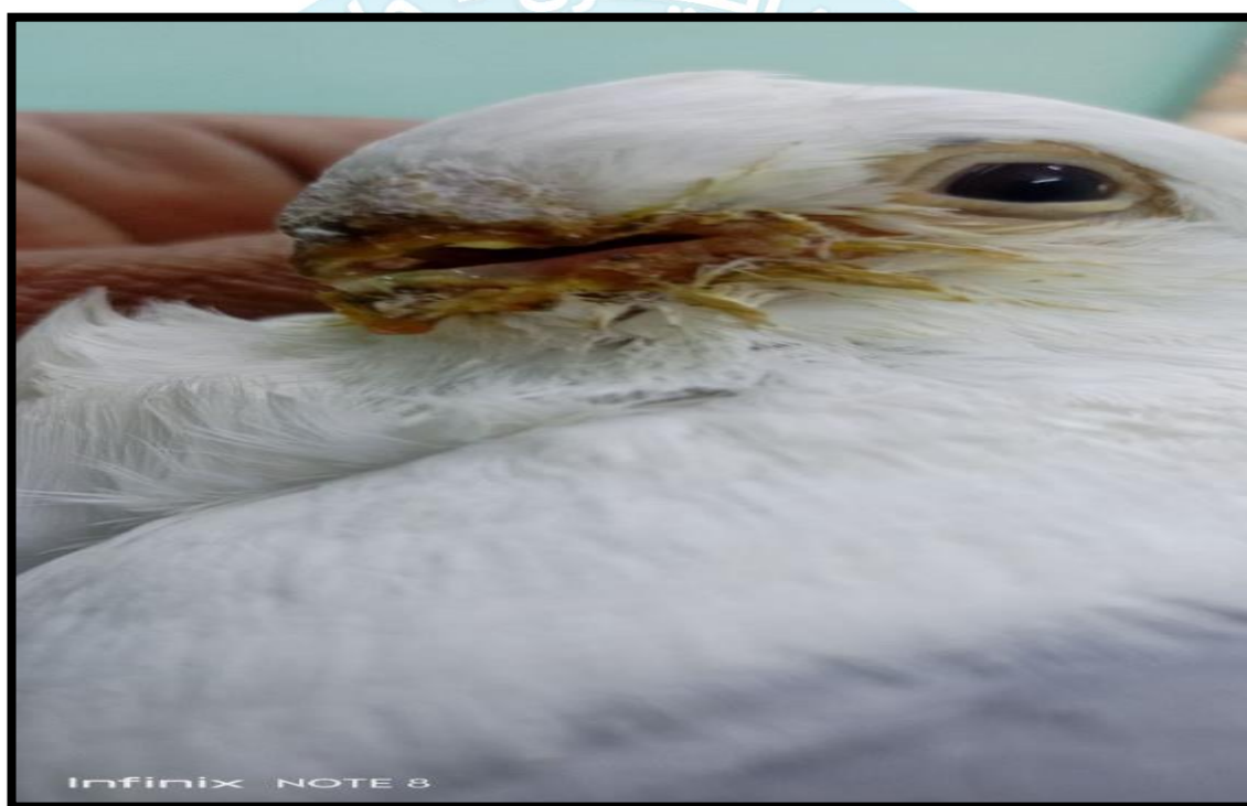
Figure(1): Domestic pigeon infected naturally with Trichomonas gallinae shows caseous material white to yellowish in color in mouth

Microscopic structures of T.gallinae were apparent when smears prepared and stained by Giemsa. the cytoplasm appeared light purple and nucleus with dark purple and clarification of the flagella , nucleus and cytoplasm very well Figure(2).