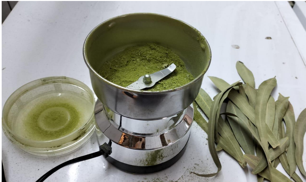
Figure (1) preparation of Eucalyptus leaves extract.

standardized suspension to 20 ml of Hinton agar at 40 C°. The test was done worked in 3