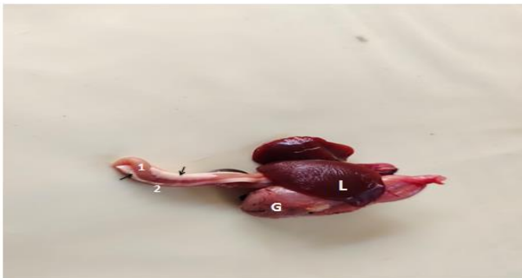
Fig.4.lower digestive system of the moorhen bird show pancreas(arrows),ascending duodenum(1),descending duodenum(2),Liver(L),Gizzard(G).