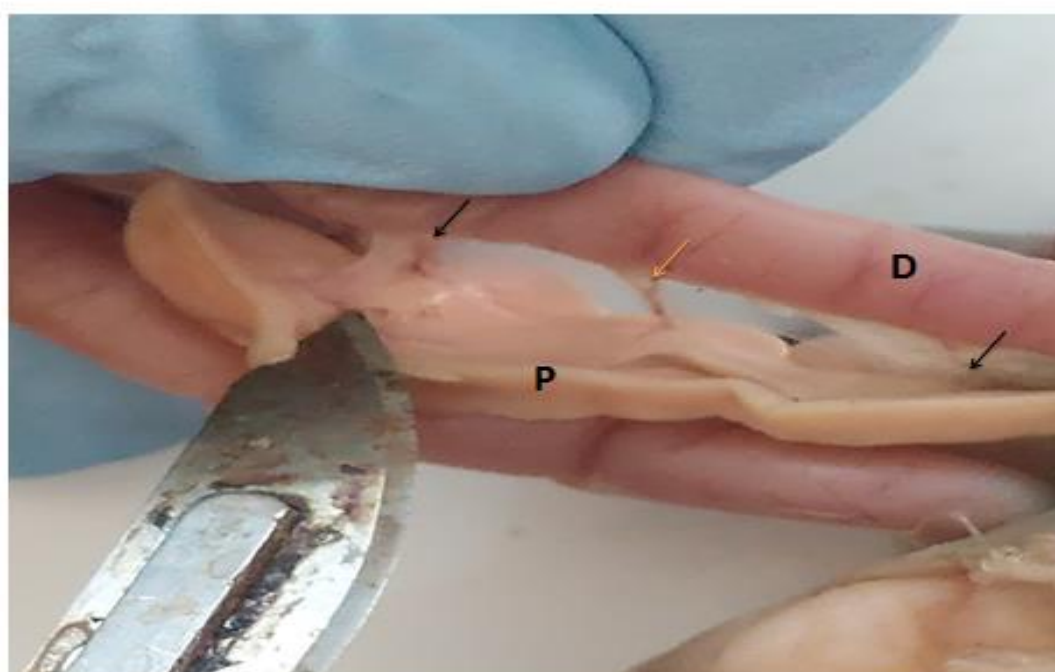
Fig.3. Show pancreas(P) and duodenum(D) of owl ,pancreatic ducts(black arrows),blood vessel(yellow arrow).