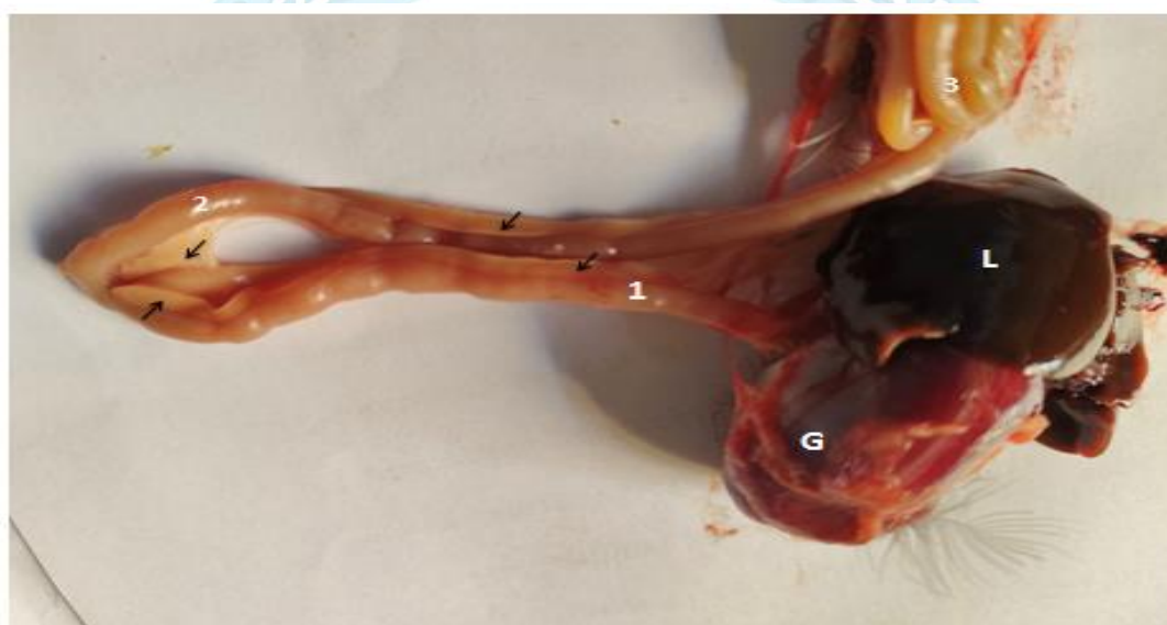
Fig.1.lower digestive system of the owl show pancreas(arrows),ascending duodenum(1),descending duodenum(2),Liver(L),Gizzard(G),Jejunum(3).