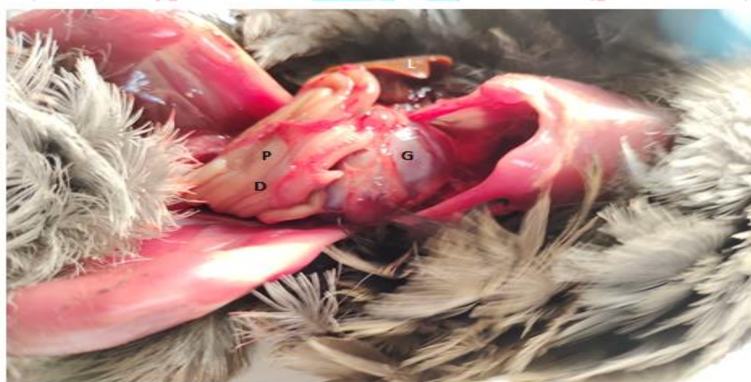
Fig.5. coelomic cavity of the moorhen bird show pancreas(p), duodenum( D), Liver(L),Gizzard(G).